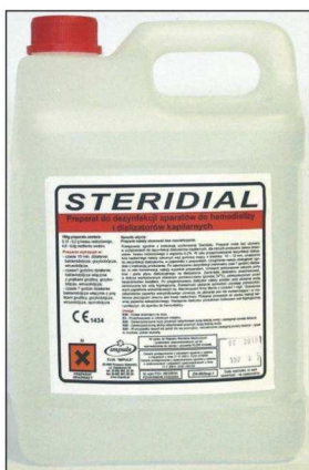
Steridial & Steridial Forte Disinfection concentrates