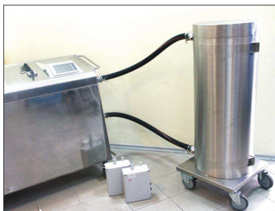
Impuls HPV800 Room decontamination system (Hydrogen Peroxide Vapours)