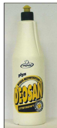
Deosan Surface decontamination concentrate