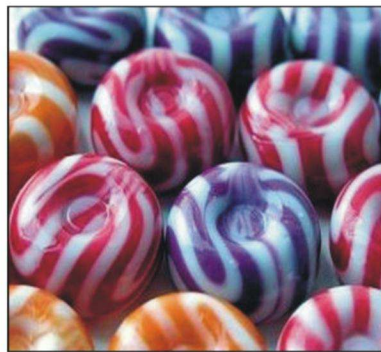
Nefretete Alcalisation sweets for dialysed patients