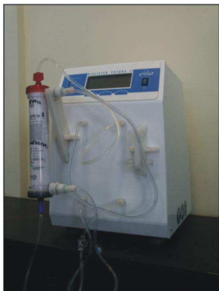
Dialister Futura II Reutilisation apparatus

Reutilisation is for us more than just one device. Impuls offers a complete system, supporting dialysis stations in everyday's activity: