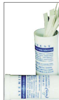
Steritest Fast and easy paper - tests