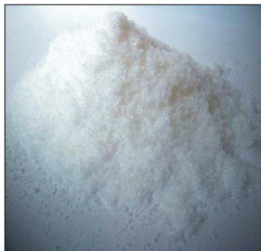
Concentrates Liquid & powder concentrates for hemodialysis